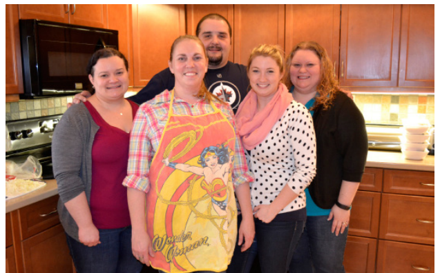
Volunteers from 24-7 Intouch made RMH guests a lovely taco dinner