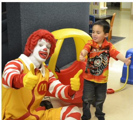
Ronald McDonald takes time to clown around with children at RMHMB during one of his many visits throughout the year

Twitter: @RMHManitoba Facebook: Ronald McDonald House Manitoba