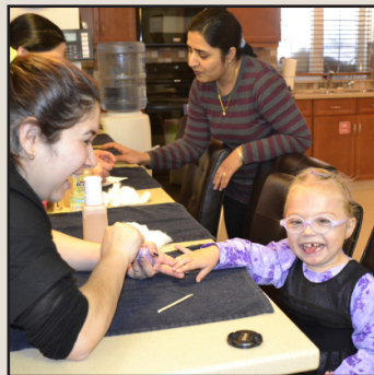
MC College pampers children and families staying at the House.