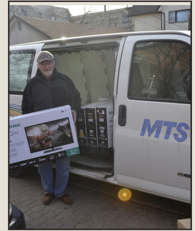
MTS Volunteers deliver a donation of 8 LCD TVs and 5 Blu-ray Players for the House and Family Room

Ronald McDonald House Manitoba supports the health and well-being of children by providing a “home away from home” and other services for critically ill, chronically ill and seriously injured children and their families.