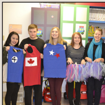
Students from Garden City Collegiate deliver tutus and superhero capes for children at the House.