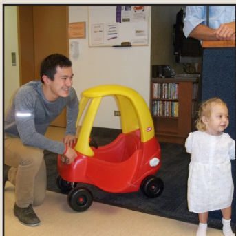
Canadian Olympic figure skater Patrick Chan spends some time with the kids at RMHMB.