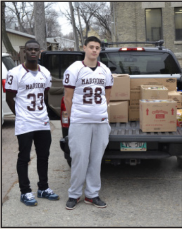
Winnipeg High School Football League Food Drive