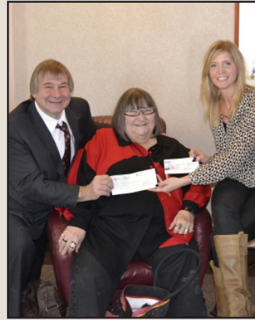
Ralph Island Jewellers presents $1100 donation on behalf of Canadian Jewellery Group