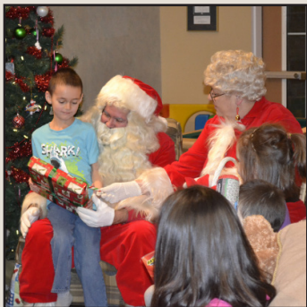
Santa and Mrs. Claus celebrate the holidays at Ronald McDonald House.

Ronald McDonald House Manitoba supports the health and well-being of children by providing a “home away from home” and other services for critically ill, chronically ill and seriously injured children and their families.