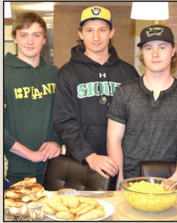
Sanford Collegiate Hockey Team Home for Dinner