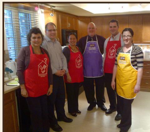
McDonald's corporate staff cooked up a storm for families in 2012.