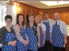
RBC Royal Bank

You are welcome to stay and enjoy your meal with our families but please prepare additional food to accommodate your group.