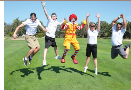
Team Homestead Manitoba w/ Ronald McDonald