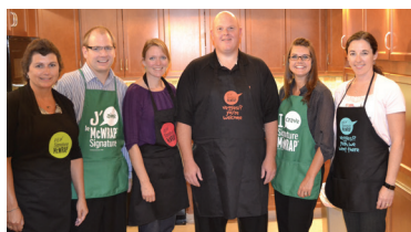
McDonald's Corporate Head Office