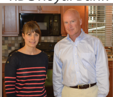
The Keg Restaurants